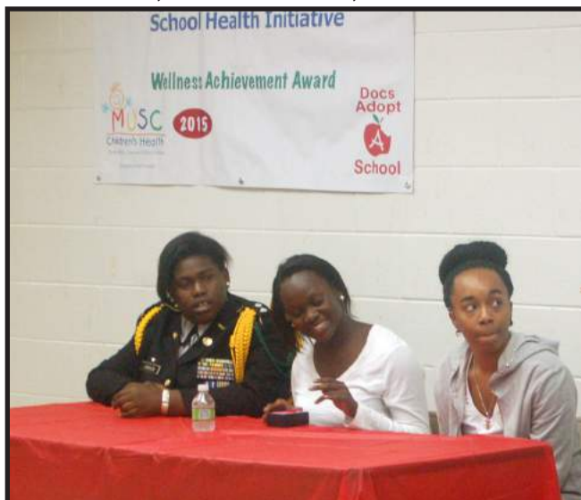
The panel of Senior Quiz Bowl contestants