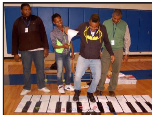
Vikings on the Move at the Career Fair