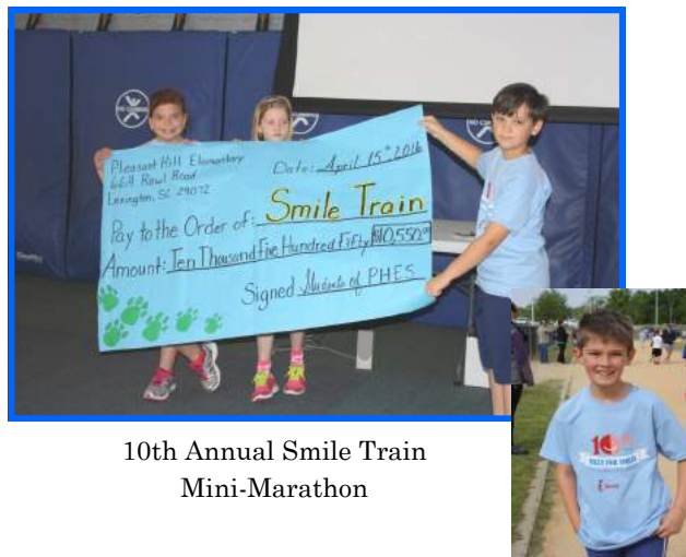
10th Annual Smile Train Mini-Marathon