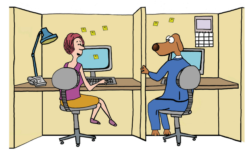
"It looks like you've been well trained."

SC-SIC also offers advance training in several topic areas including SIC Leadership, Communications and Advocacy, and SIC Goal-Setting. You can find descriptions of these trainings on the SC-SIC website. Contact SC-SIC today to schedule a training for your district!