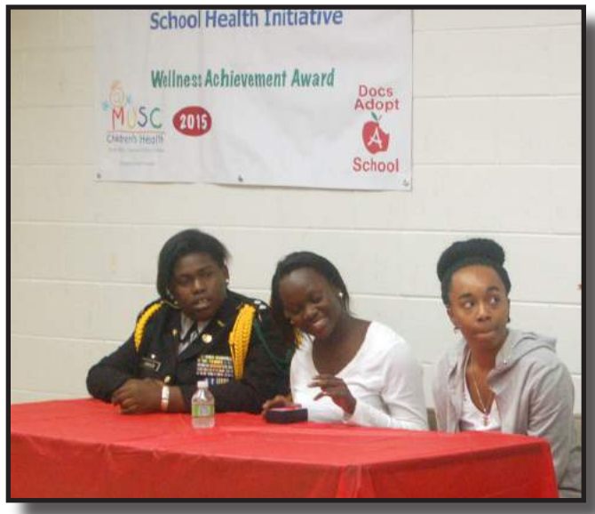
The panel of Senior Quiz Bowl contestants